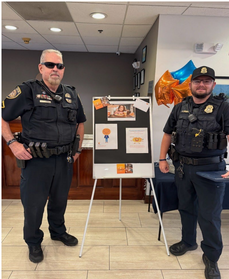
National Waffle Day at Comfort Inn