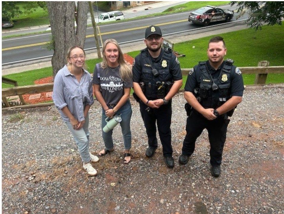
DDBA Meeting Smoking Fly Cigars Shop