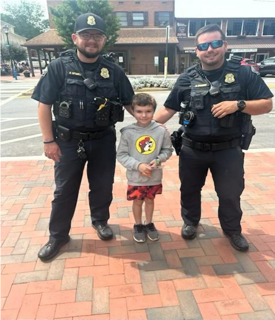
Officers greeting visitors to the square