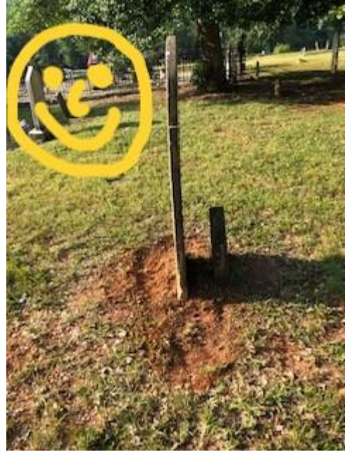
Fractured and tilted markers under consideration for repair in Section 5