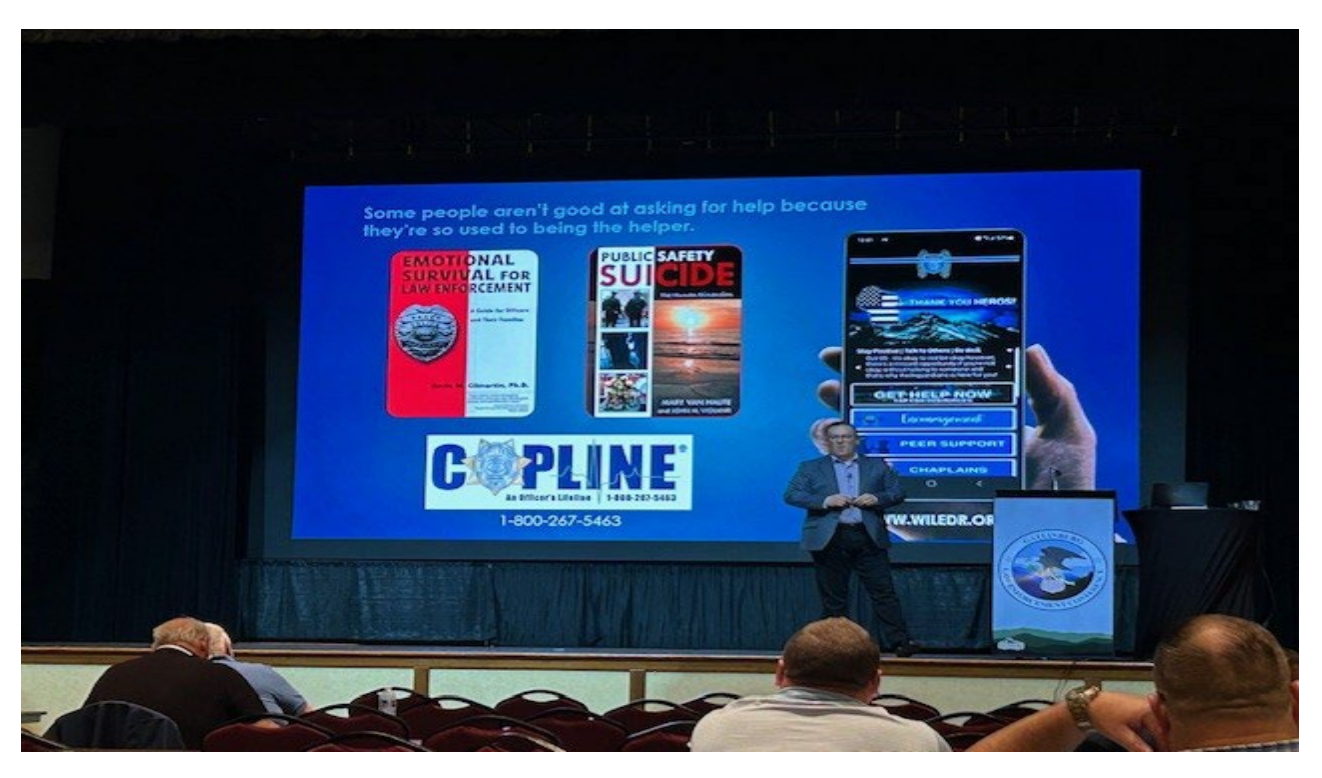
Gatlinburg Law Enforcement Conference