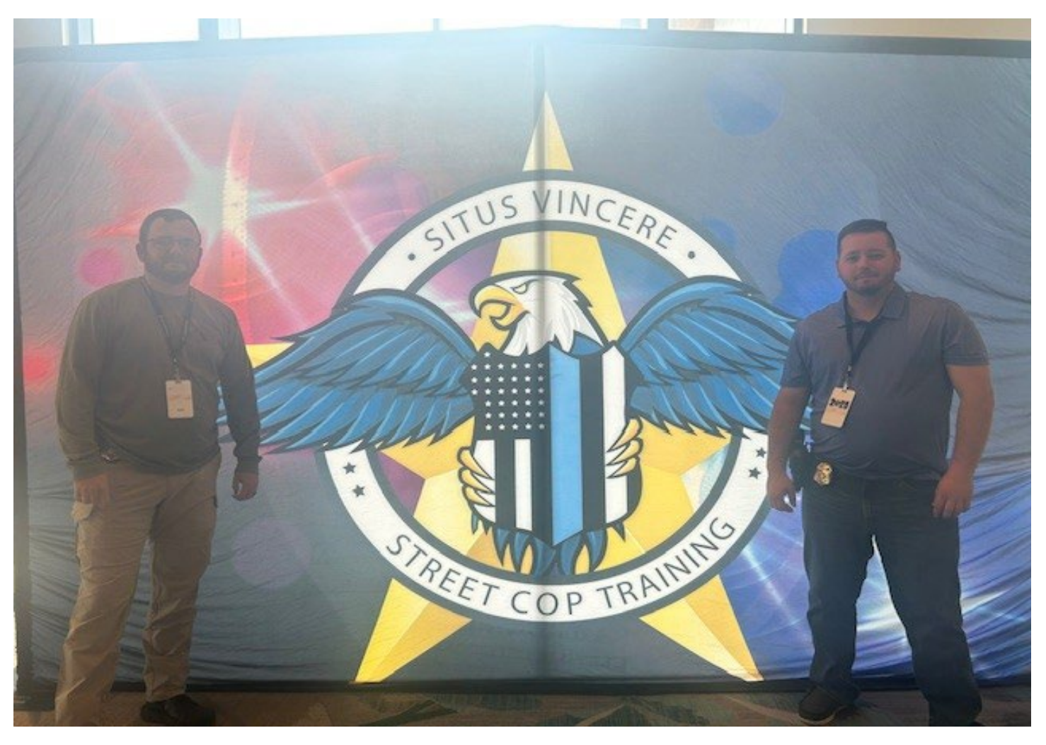
Street Cop Training Nashville, TN