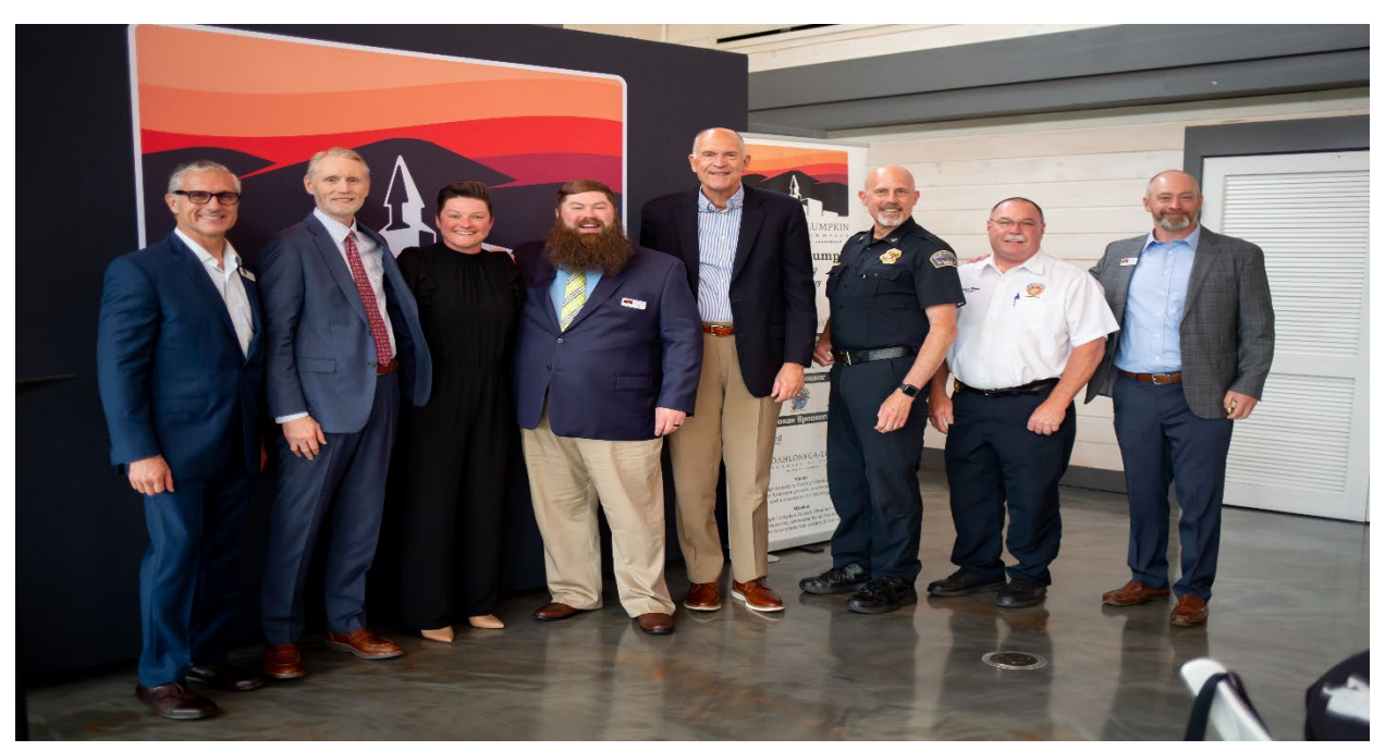
2025 Leadership Lumpkin Graduation Dinner for Class of 2025 presented by NGHS