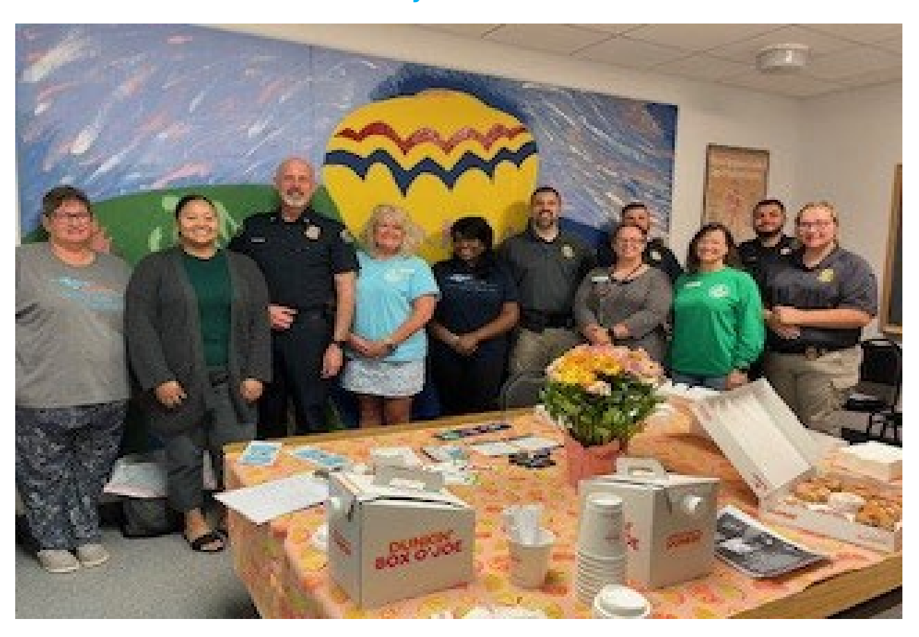
Donuts with Avita/ Review of Mental Health Awareness