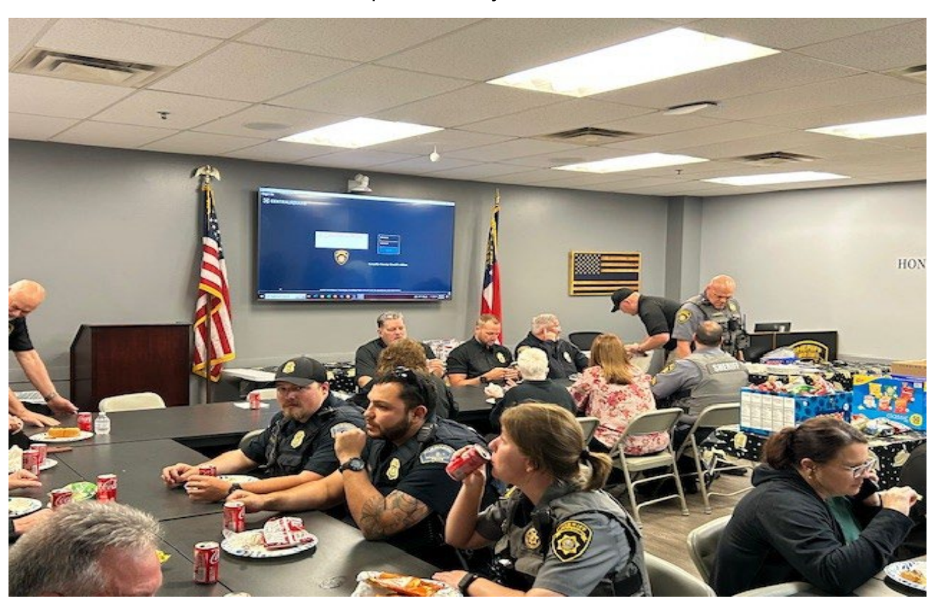
Officer Appreciation Luncheon