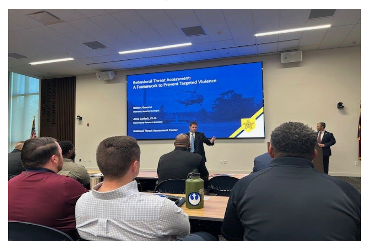
Threat assessment class presented by the US Secret Service and GBI