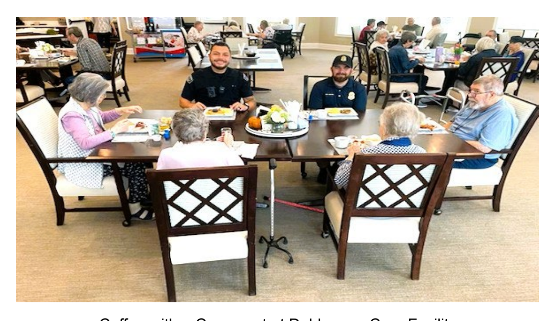
Coffee with a Cop event at Dahlonega Care Facility