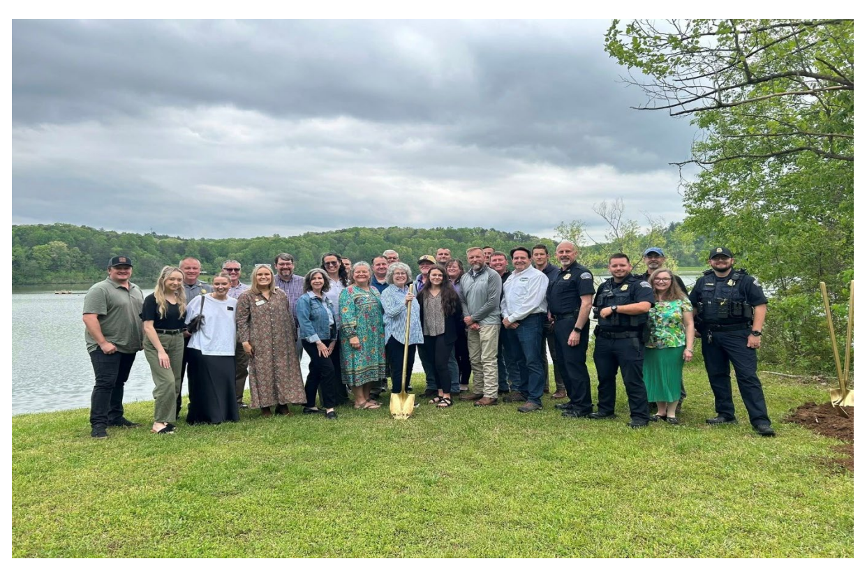
Groundbreaking of the Morrison Moore Parkway Pedestrian Bridge