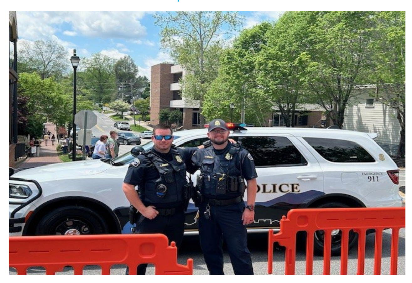
Bear on the Square