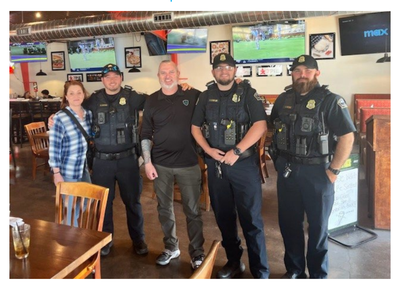
Farewell Lunch for Loss Prevention Manager from Walmart