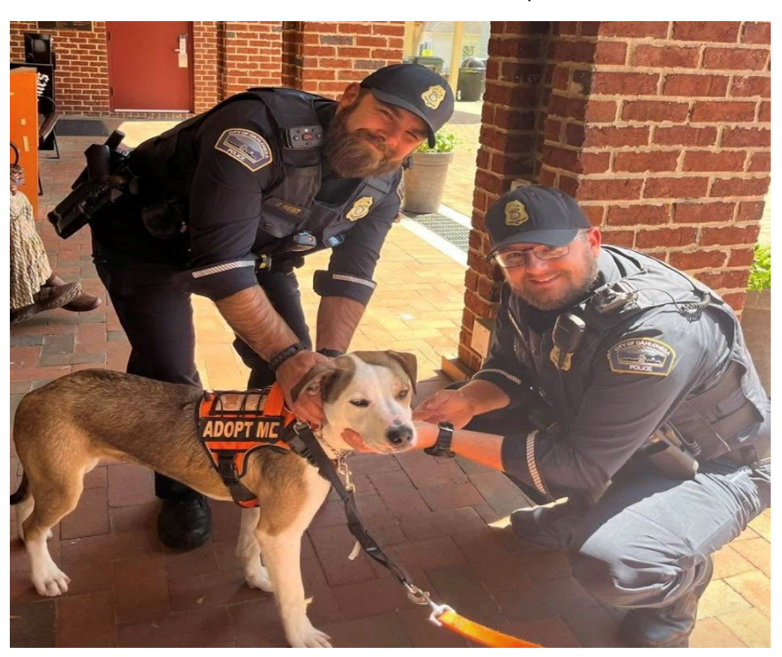
Foot Patrols on the Square