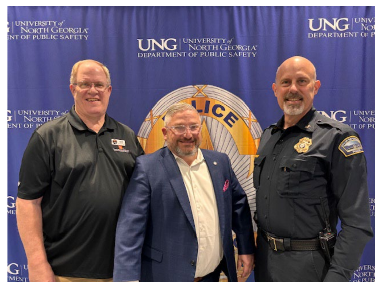
Lumpkin Leadership Meeting