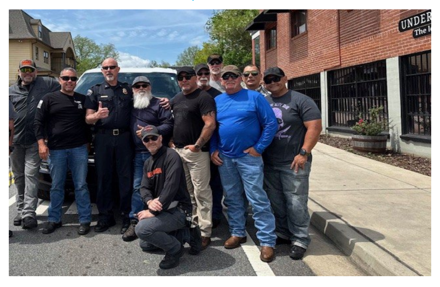
Bear on the Square