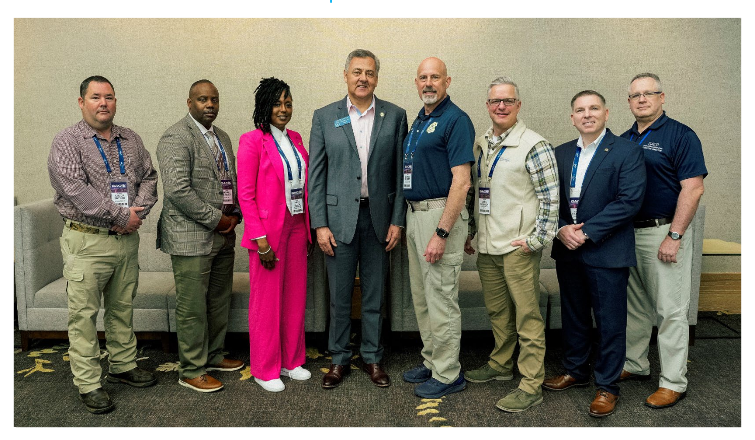
GACP Legislative committee with Senator Gooch at conference