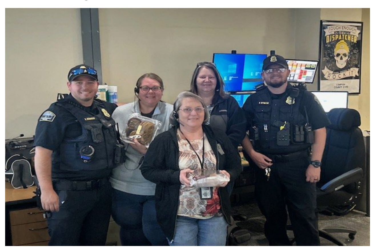
National Telecommunications Appreciation Week