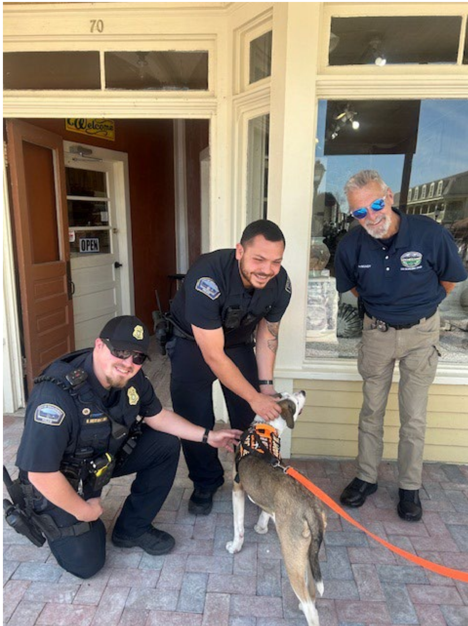
Giving some love to the pets up for adoption while on foot patrol