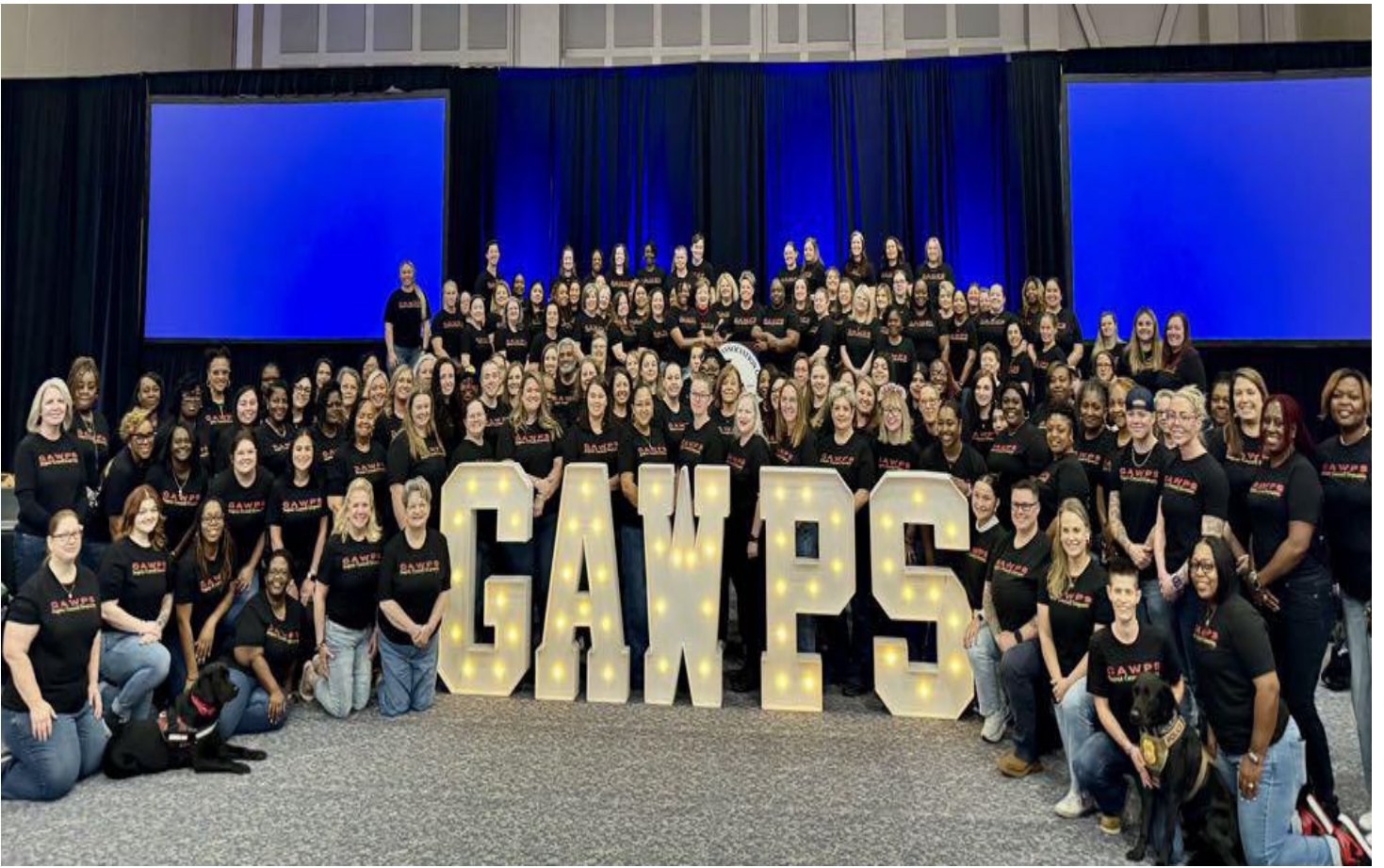
Georgia Association of Women in Public Safety Conference