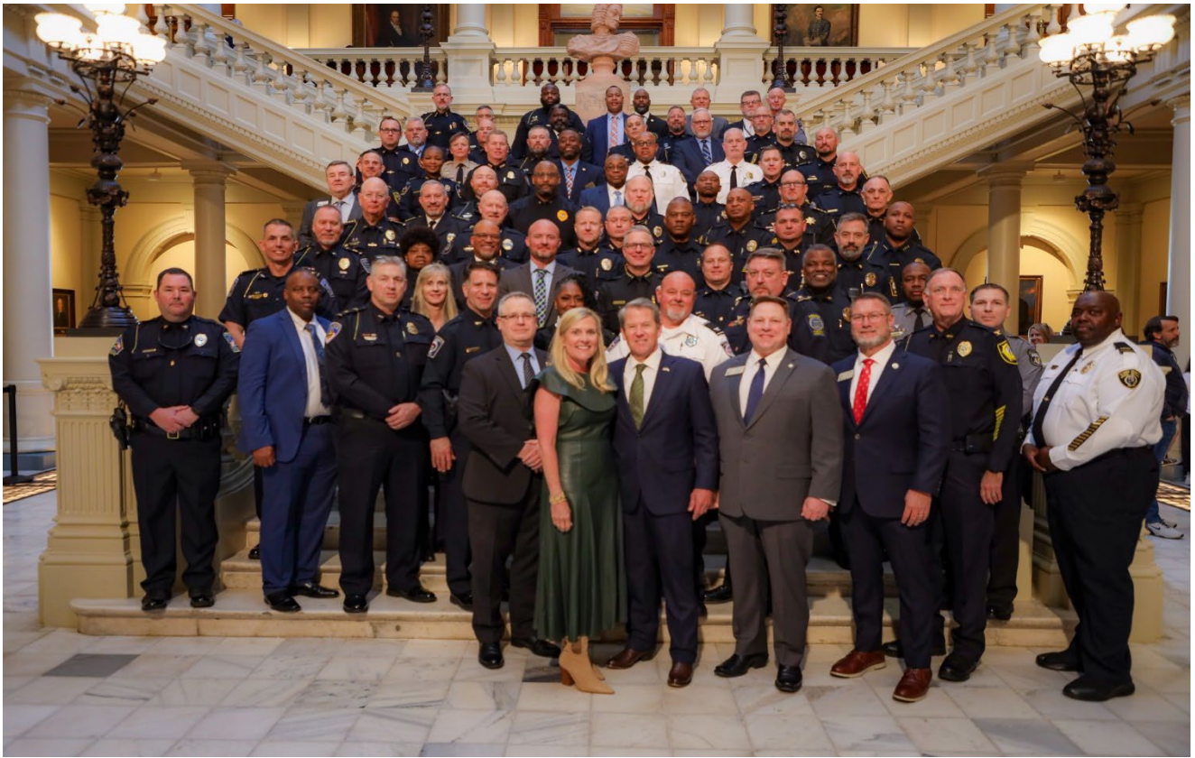
Chiefs' Day at Georgia State